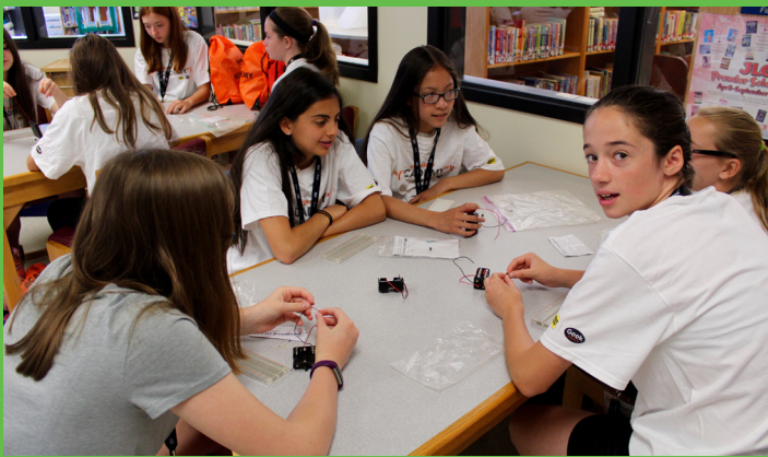
Geek Squad Academy