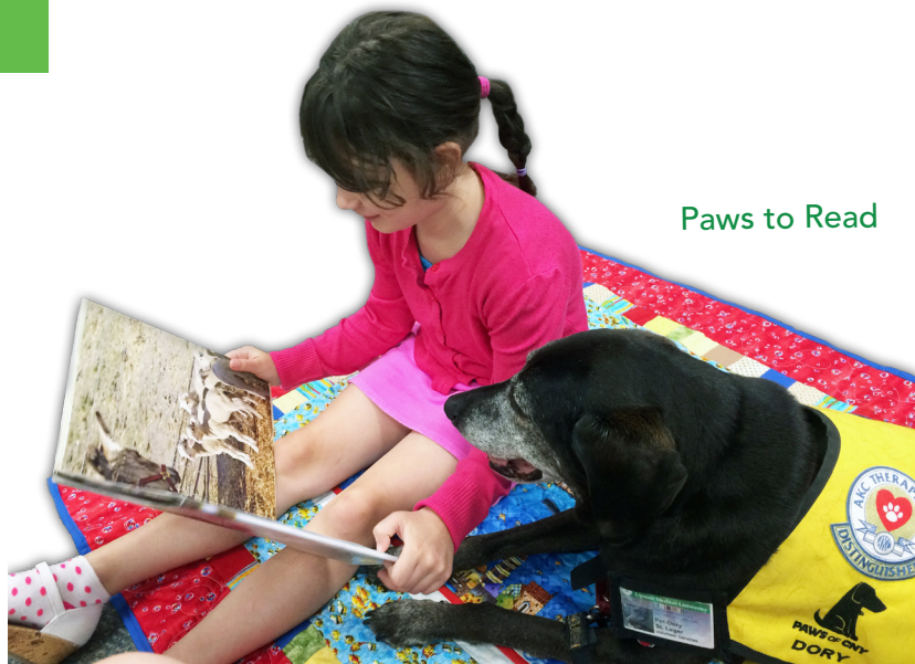
Paws to Read