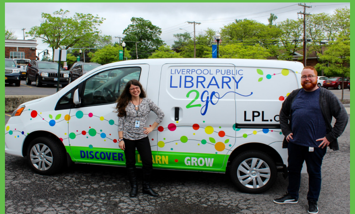
New Outreach Van