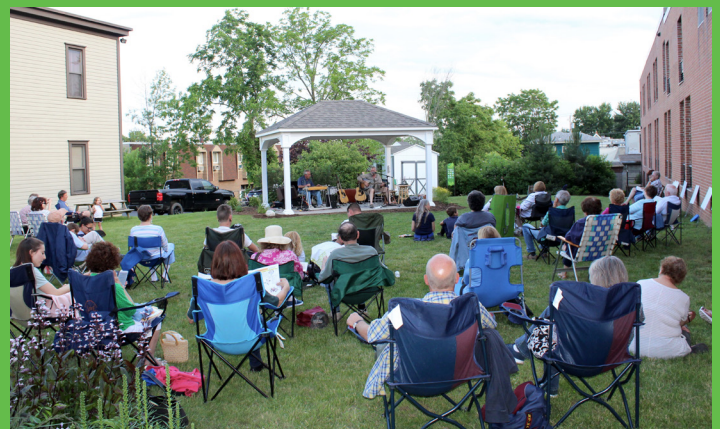
Concert at the New Pavilion