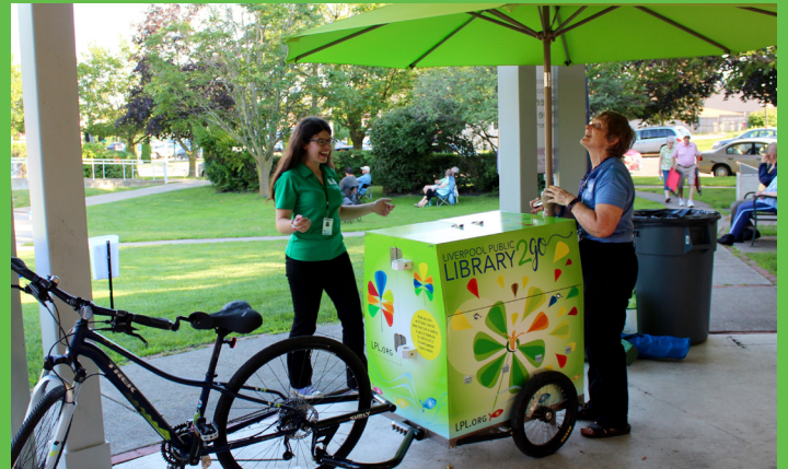
New Bike Cart