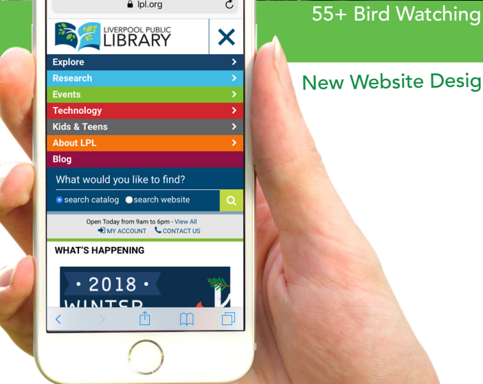
New Website Design

With continued library financial prudence and Liverpool taxpayer support, 2018 is full of possibilities. The coming year will include most importantly the first floor redesign, but also exploration into a school district-wide student library card and expanded outreach including possibly a pop up library location. I look forward to staff and patron input on other exciting ventures to explore at LPL.