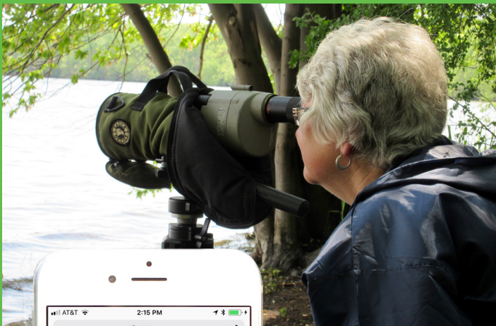
55+ Bird Watching