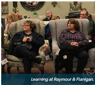
Learning at Raymour & Flanigan.