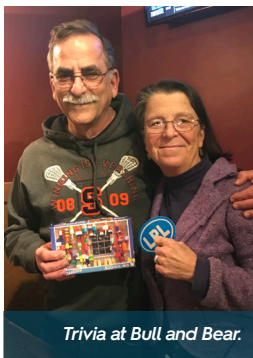
Trivia at Bull and Bear.