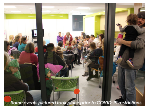
Some events pictured took place prior to COVID-19 restrictions.